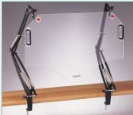
Double Shield: Pictured with (A) "C" Clamps