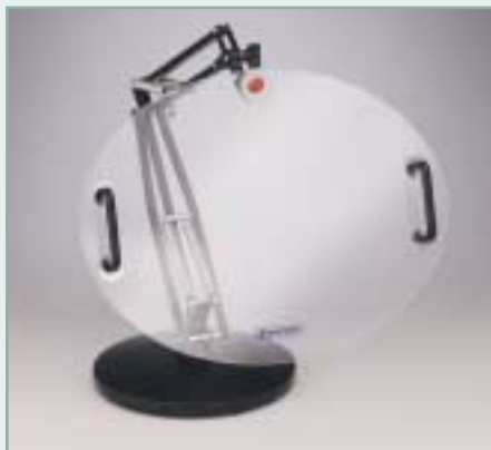
Single Shield: Pictured with (D) Weighted Base